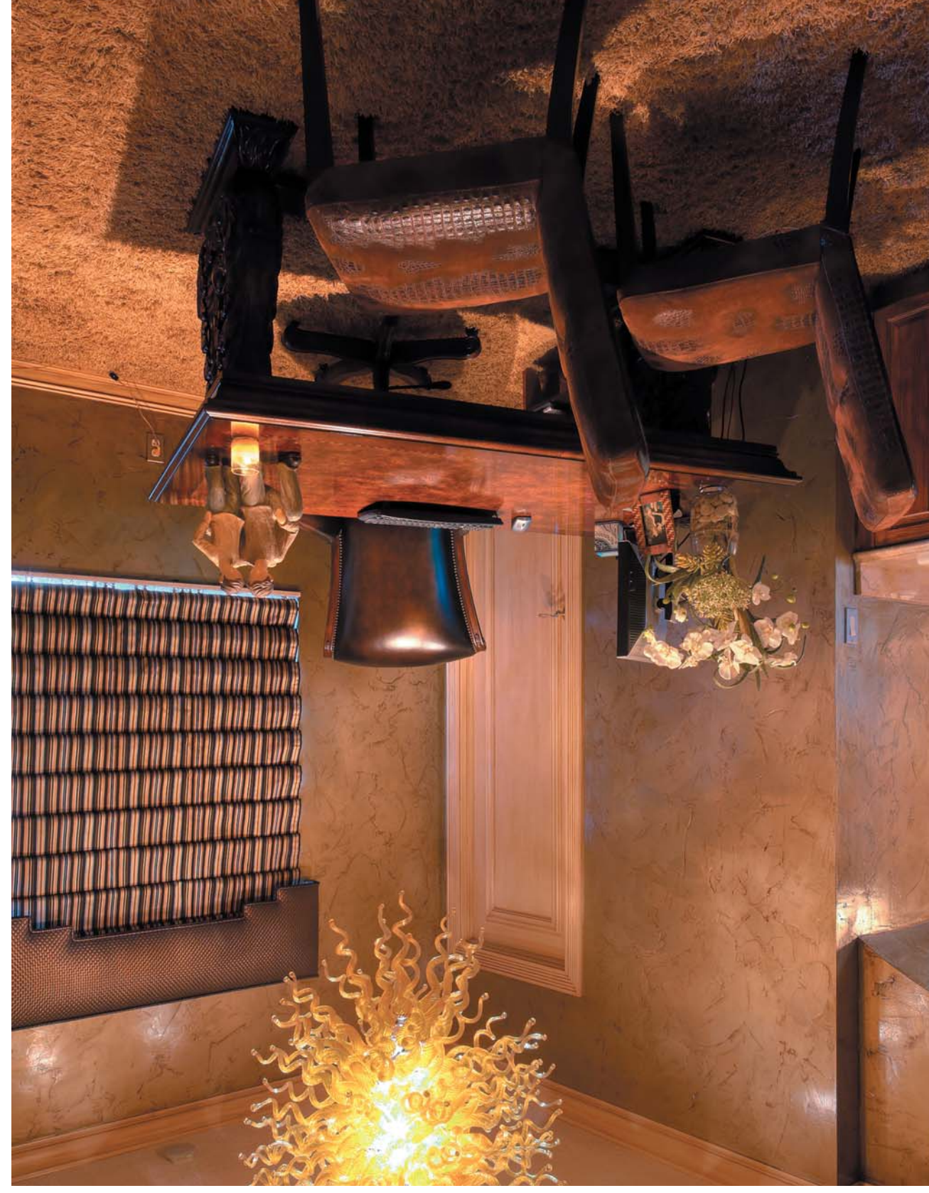
This home office is traditional in nature with the mix of contemporary accents.